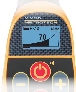
Peak locate response with accompanying audio tone

Powered by two AA alkaline batteries that typically provide 20 hours of use, the VM-540 is designed for reliable daily use.