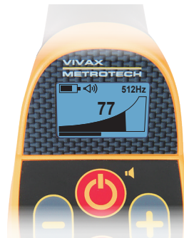
Multiple sonde frequencies