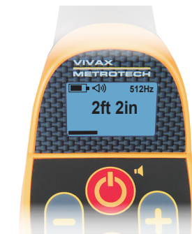
Push button depth reading