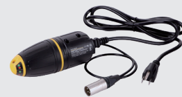
Live Plug Connector