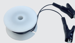
Ground Extension Spool