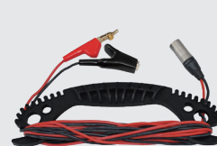
Telco Clip Direct Connection Lead