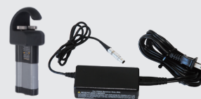
VM series Li-ion Rechargeable Transmitter Battery Kit