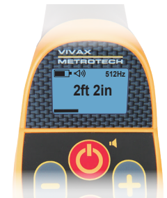
Push button depth reading