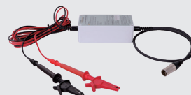
Live Cable Connector