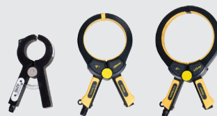
2", 4", and 5" Induction Clamps