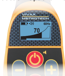
Peak locate response with accompanying audio tone

One induction, three direct connect and a fault find frequency