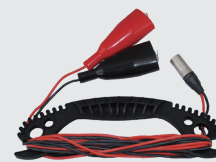
Heavy Duty Clip Direct Connection Lead