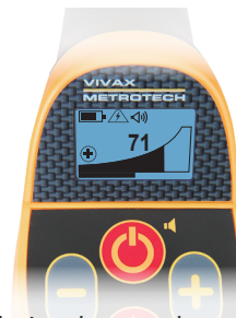
Peak signal strength response Field polarity indicator